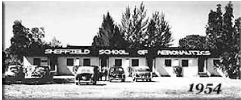
Sheffield School in Miami - 1954