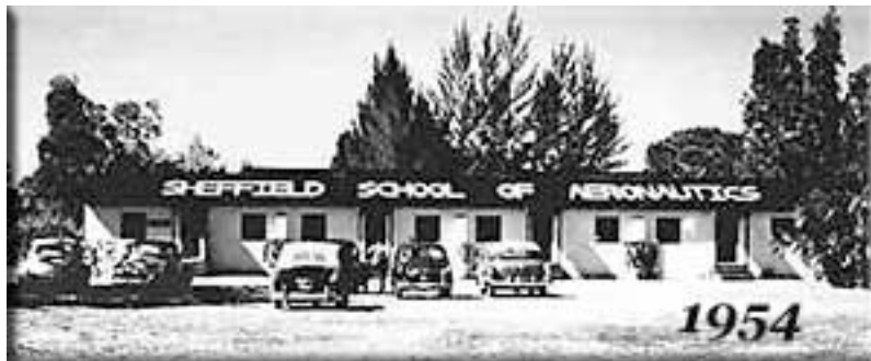
Sheffield School in Miami - 1954