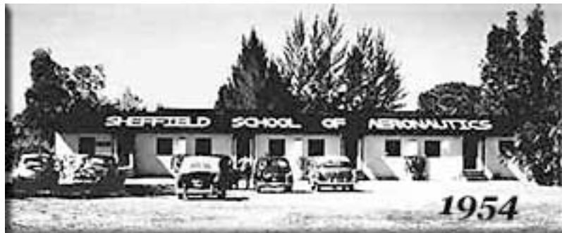
Sheffield School in Miami - 1954