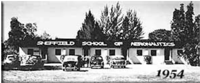
Sheffield School in Miami - 1954