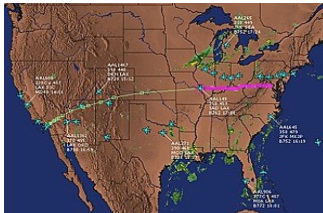
Aircraft Situation Display

In June 1999, we incorporated Aircraft Situation Display (ASD) into our curriculum. As radar is the air traffic controller's primary visual tool, ASD has become the visual guide to the Aircraft Dispatcher. This aid is an incredible learning tool as well as an outstanding visual introduction to the world of preplanning, and flight monitoring.