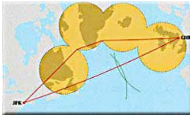
Route Comparison: Non-ETOPS (restricted near coastline) vs. ETOPS (more flexibility)

ETOPS training for pilots and dispatchers originated when the FAA began granting authorization for the airlines to operate twin engine aircraft, such as the Boeing 757, over oceanic and other desolated areas. The objective of the ETOPS Workshop is to familiarize the student with the regulations and techniques pertaining to these specific operations. Beginning March-April 2007, the ETOPS class incorporated the most recent changes, procedures, and regulations in Extended Operations, including non-twin aircraft.