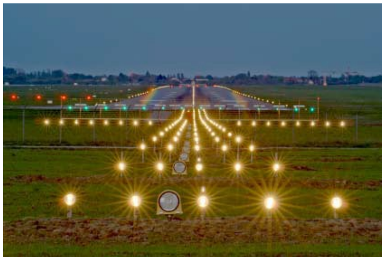
Airport Runway & Approach Lighting

*International applicants only (I-20 form processing/SEVIS electronic processing, and shipping and handling [FedEx charges] included)