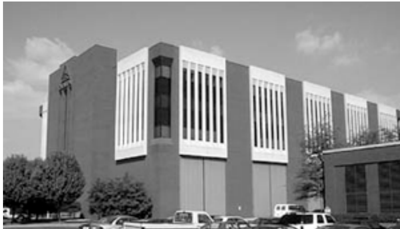
Delta Air Lines' World Headquarters Atlanta, Georgia

Most airlines will have a centrally located dispatch office that controls all the flights of that particular airline. As an example, United Airlines' dispatch office is in Chicago, Delta AirLines' Operational Control Center is located in Atlanta, U.S. Airways' is located in Pittsburgh, American's is in Dallas, Spirit Airlines' is in South Florida, Comair's in Cincinnati, Endeavor Airlines is in Minneapolis, etc.