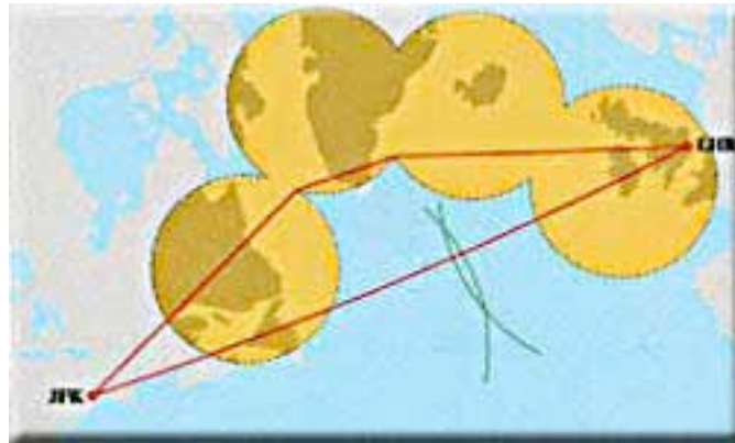
Route Comparison: Non-ETOPS (restricted near coastline) vs. ETOPS (more flexibility)

ETOPS training for pilots and dispatchers originated when the FAA began granting authorization for the airlines to operate twin engine aircraft, such as the Boeing 757, over oceanic and other desolated areas. The objective of the ETOPS Workshop is to familiarize the student with the regulations and techniques pertaining to these specific operations. Beginning March-April 2007, the ETOPS class incorporated the most recent changes, procedures, and regulations in Extended Operations, including non-twin aircraft.