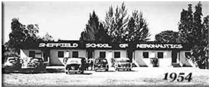
Sheffield School in Miami - 1954