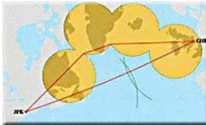
Route Comparison: Non-ETOPS (restricted near coastline) vs. ETOPS (more flexibility)

ETOPS training for pilots and dispatchers originated when the FAA began granting authorization for the airlines to operate twin engine aircraft, such as the Boeing 757, over oceanic and other desolated areas. The objective of the ETOPS Workshop is to familiarize the student with the regulations and techniques pertaining to these specific operations. Beginning March-April 2007, the ETOPS class incorporated the most recent changes, procedures, and regulations in Extended Operations, including non-twin aircraft.