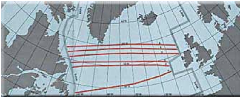
North Atlantic Track (route) System

The Advanced International Flight Planning workshop takes the student beyond the basics of international flight planning covered in the regular full-time course required for the dispatcher's license. In this 2-day course the student learns advanced dispatching procedures that apply to international operations. Classes are normally offered immediately following the regular dispatcher course. The objective of the workshop is to better prepare those students who anticipate working for an international operator, providing valuable information and techniques necessary to perform the job.