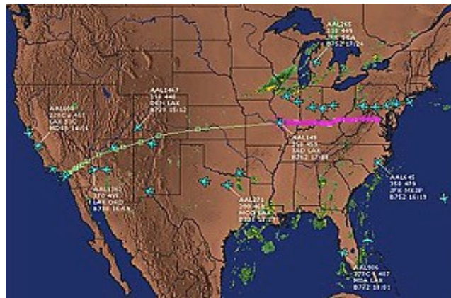
Aircraft Situation Display

In June 1999, we incorporated Aircraft Situation Display (ASD) into our curriculum. As radar is the air traffic controller's primary visual tool, ASD has become the visual guide to the Aircraft Dispatcher. This aid is an incredible learning tool as well as an outstanding visual introduction to the world of preplanning, and flight monitoring.