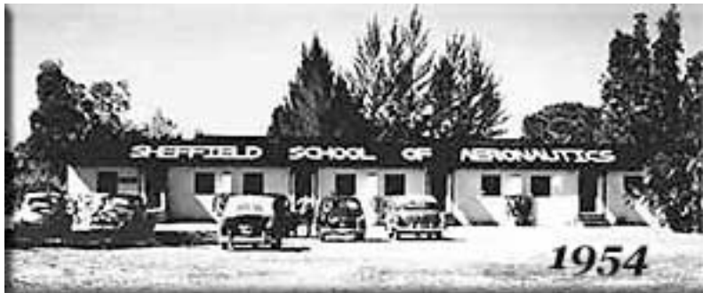
Sheffield School in Miami - 1954