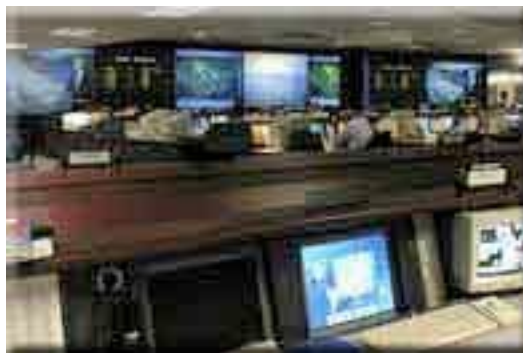
Delta Air Lines Operational Control Center